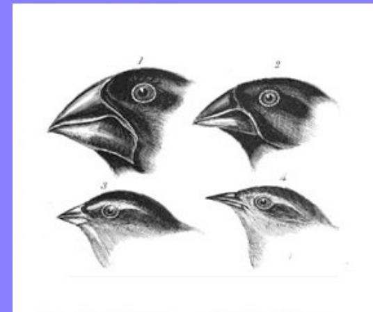
The wide spectrum of bill sizes and shapes downloaded from www.geolsoc.org.uk

From BSCS, Biological Science: Molecules to Man, Houghton Mifflin Co., 1963