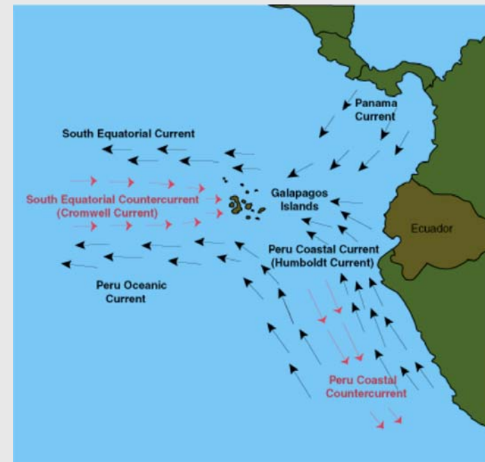
Geographical position of the Galapagos