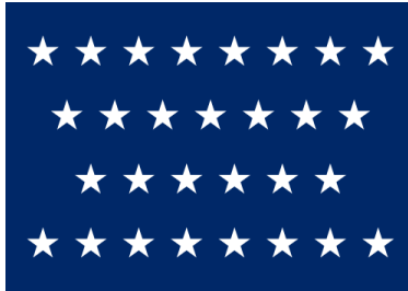
Figure 4: 29 star Union Jack

Despite the fact that 29 has no nice arrangement of stars, there was a time when a 29 star Union Jack was needed (Figure 4). One can always come up with some arrangement of stars for any number but in the long run the U.S. is going to have to get more and more creative to accommodate additional states (and stars!) into the Union.